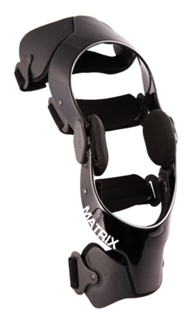
MATRIX PRO KNEE BRACE