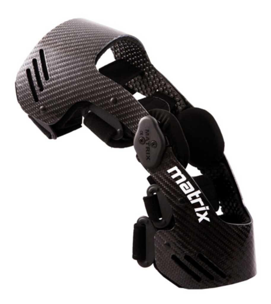
MATRIX LITE KNEE BRACE