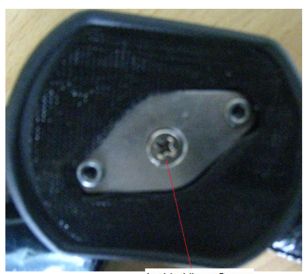
Inside View: Screw holding the stop